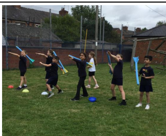
Y2 Sports Day