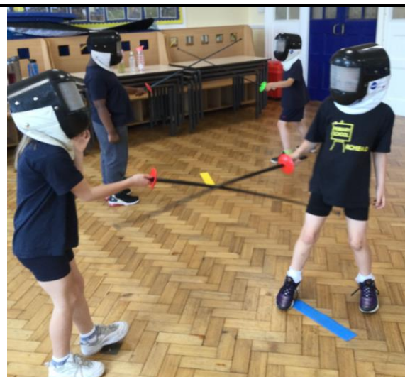
Class 5 tried fencing!