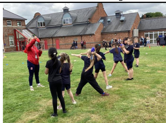
Y3 Sports Day Event (before it rained!)