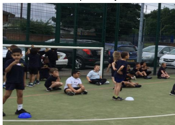
Y2 Sports on the MUGA