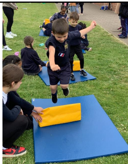
Y1 Sports Day