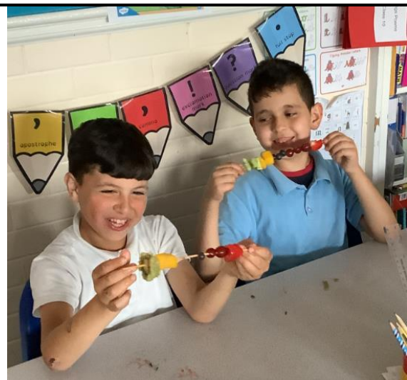
Class 10 made, ate and enjoyed fruit kebabs.